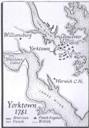
The final great battle of the Revolutionary War was fought at Yorktown, Virginia, in 1781.

[A spirit of mutiny spread over American troops.]