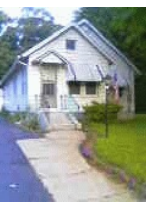
Front of 47 Long Hill St