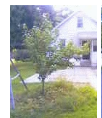
Our Back Yard