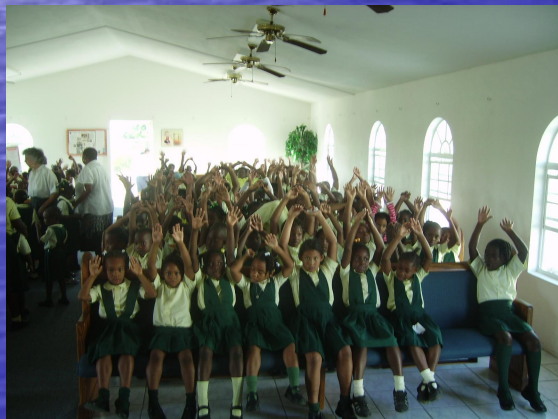
All School Devotions (2X M&F Weekly)